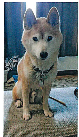
My dog waiting for our morning walk!