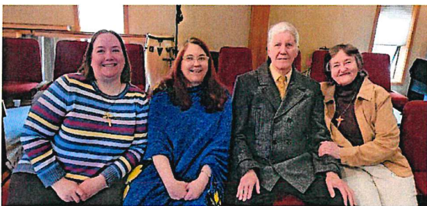
The Bade family on Easter Sunday