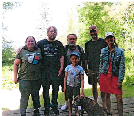
The Haukaas Family in Minnesota